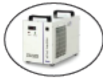
Water Chier CW3000/5000/5200